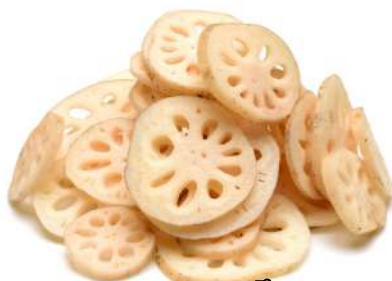
Lotus root slice