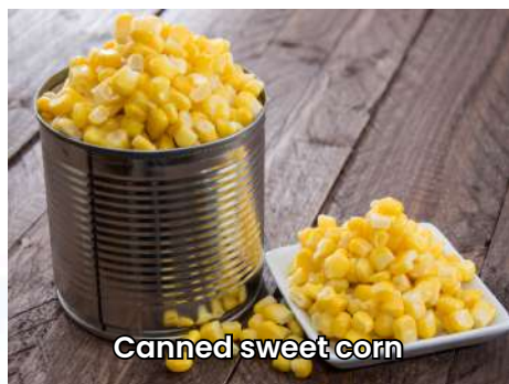
Canned sweet corn