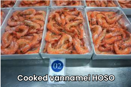
Cooked vannamei HOSO