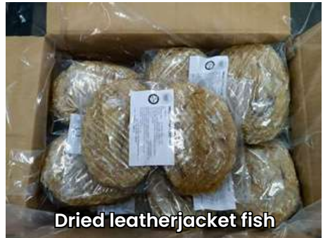
Dried leatherjacket fish