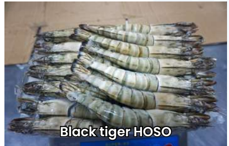
Black tiger HOSO