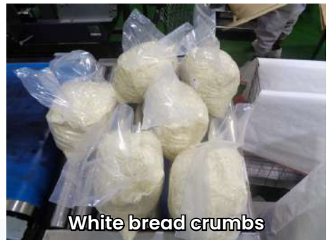
White bread crumbs