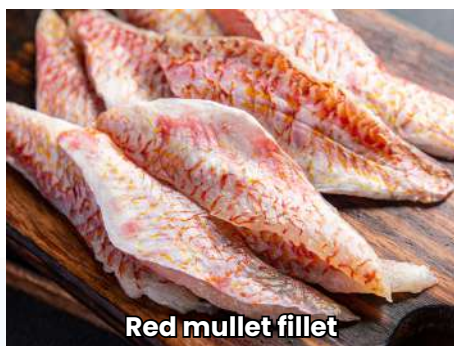
Red mullet fillet