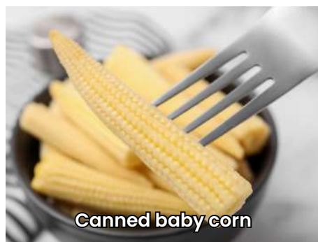
Canned baby corn