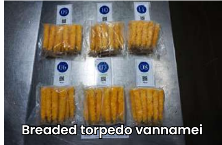
Breaded torpedo vannamei