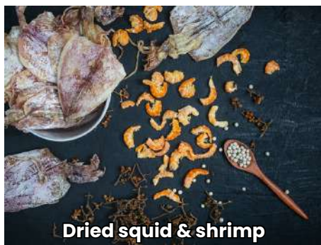
Dried squid & shrimp