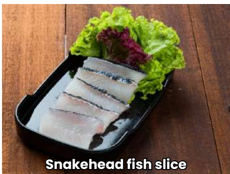
Snakehead fish slice