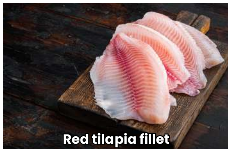
Red tilapia fillet