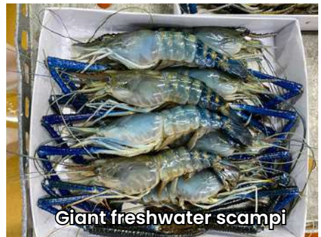
Giant freshwater scampi