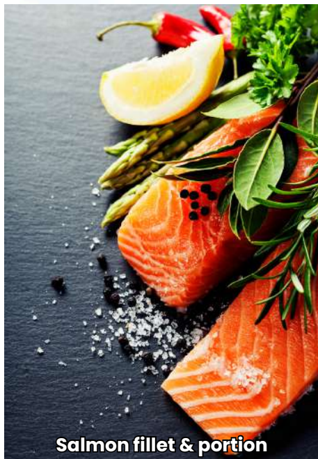
Salmon fillet & portion